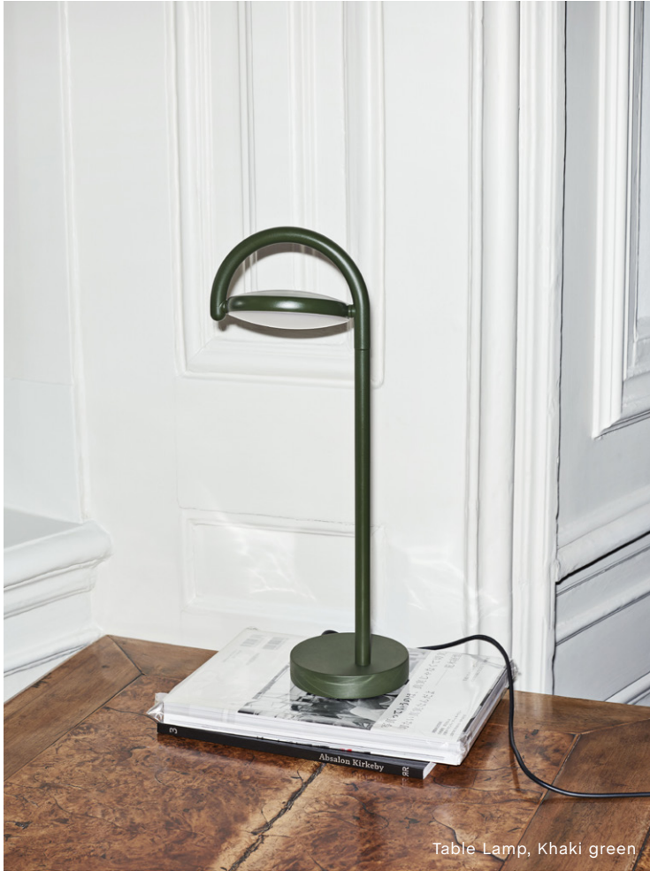
Table Lamp, Khaki green