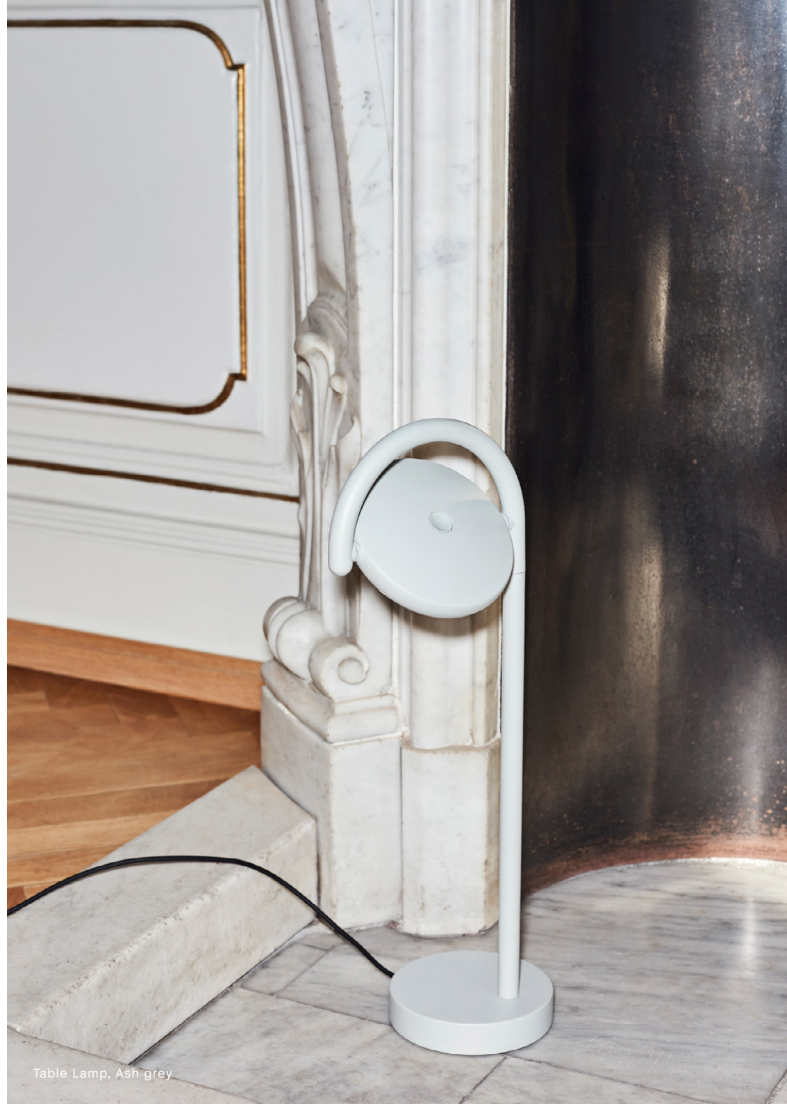
Table Lamp, Ash grey