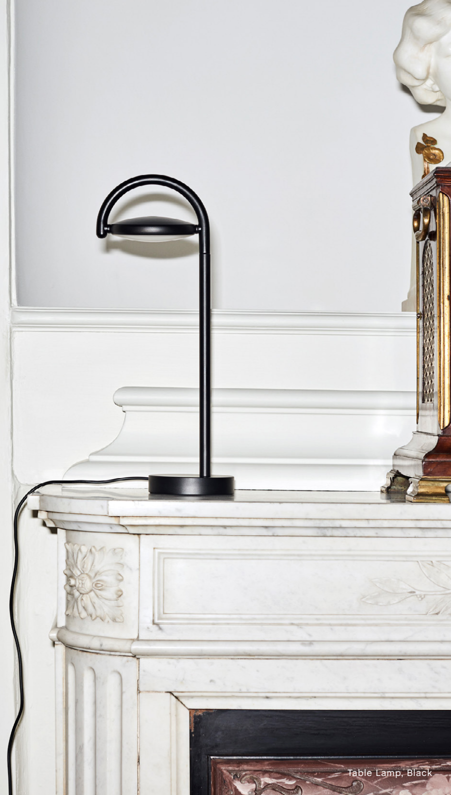
Table Lamp, Black