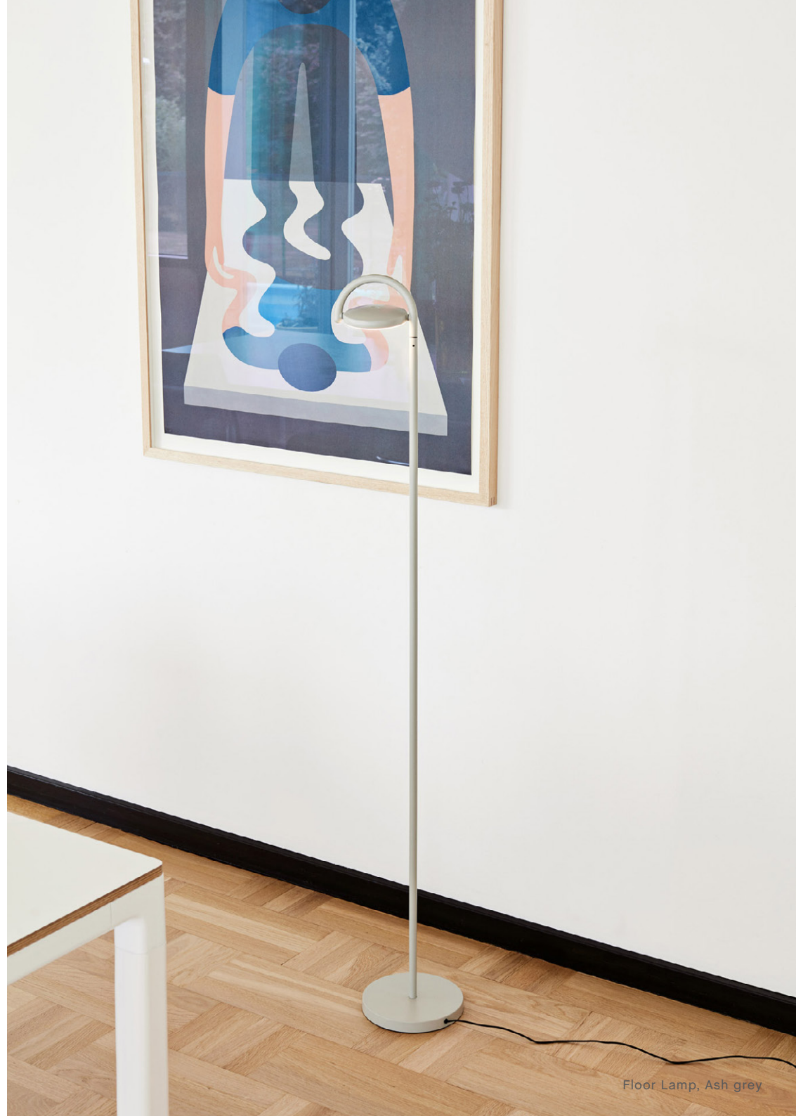
Floor Lamp, Ash grey