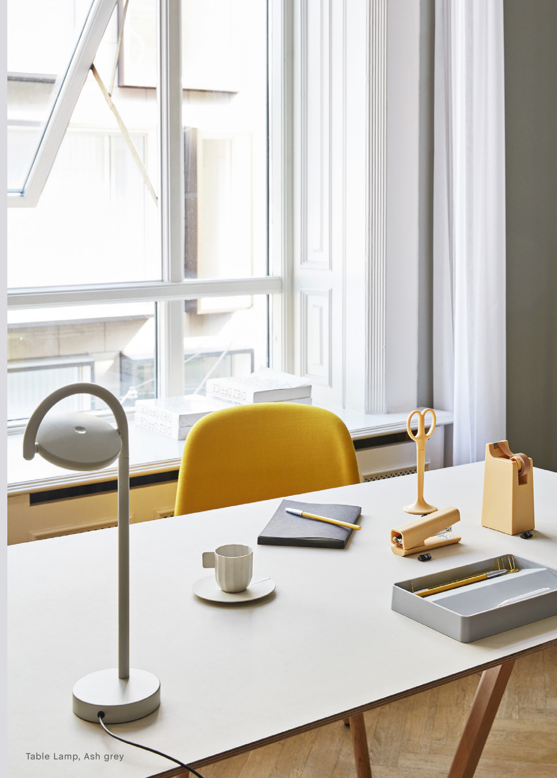
Table Lamp, Ash grey

Inspired by the bent tubing around local danish street signs, design duo kaschkasch have created a family of table and floor lamps sharing the same arched silhouette. The light source comes from a tilting circular disc, which can be adjusted to create both an indirect ambient and direct task light beam. The lamp body is crafted from powder coated die cast aluminium and steel, and the light source is an injection moulded polycarbonate opalescent lens that conceals a flat panel of light. Both lamp designs are available in different colours and are suitable for a variety of private and corporate settings.