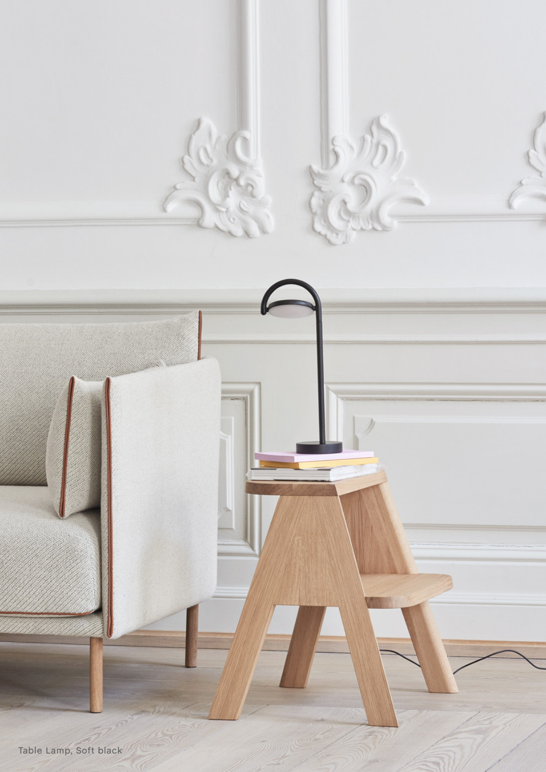
Table Lamp, Soft black