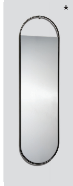
Peek oval large - item nr. 3074

Product type: Wall mirror series Design: Elina Ulvio, 2018 Materials: Steel, tinted mirror glass Colour: Black Net weight circular small: 2.2 kg Net weight oval small: 4.1 kg Net weight circular large: 8.6 kg Net weight oval large: 11.0 kg Outer package small: 2 Outer package large: 1