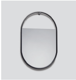
Peek oval small - item nr. 3072