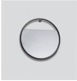
Peek circular small - item nr. 3071