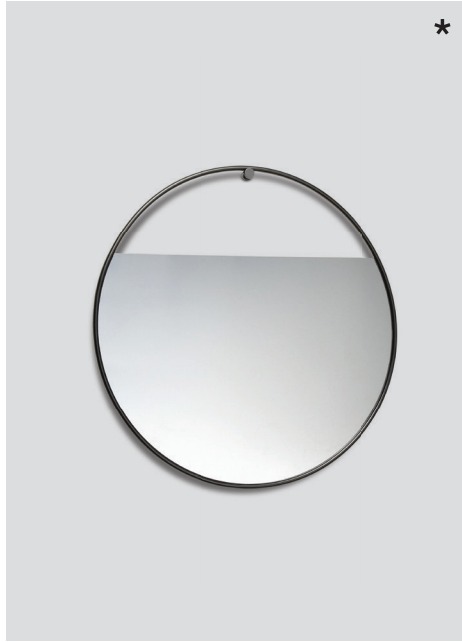
Peek circular large - item nr. 3073